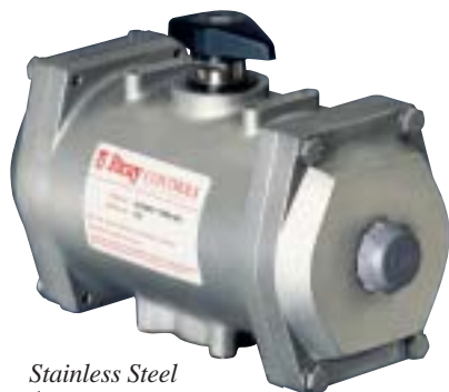
Stainless Steel Actuator

acting units. The Series 93 spring cartridges are inherently safe. The standard spring cartridge system is available for 40, 60, 80 and 100 psi services (3, 4, 5, 6 and 7 bar). NAMUR interface of air supply ports is standard on all Series 92/93 actuators. In addition, Bray actuators comply with ISO 5211 and VDI/VDE 3845 (NAMUR recommendations) dimensions and mount directly to Bray valves without using external linkages. Standard units have anodized aluminum bodies with polyester coated end caps. Stainless Steel and Electroless Nickel plated aluminum actuators are available.