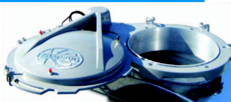
Sleek design houses functional components “out of harms way”